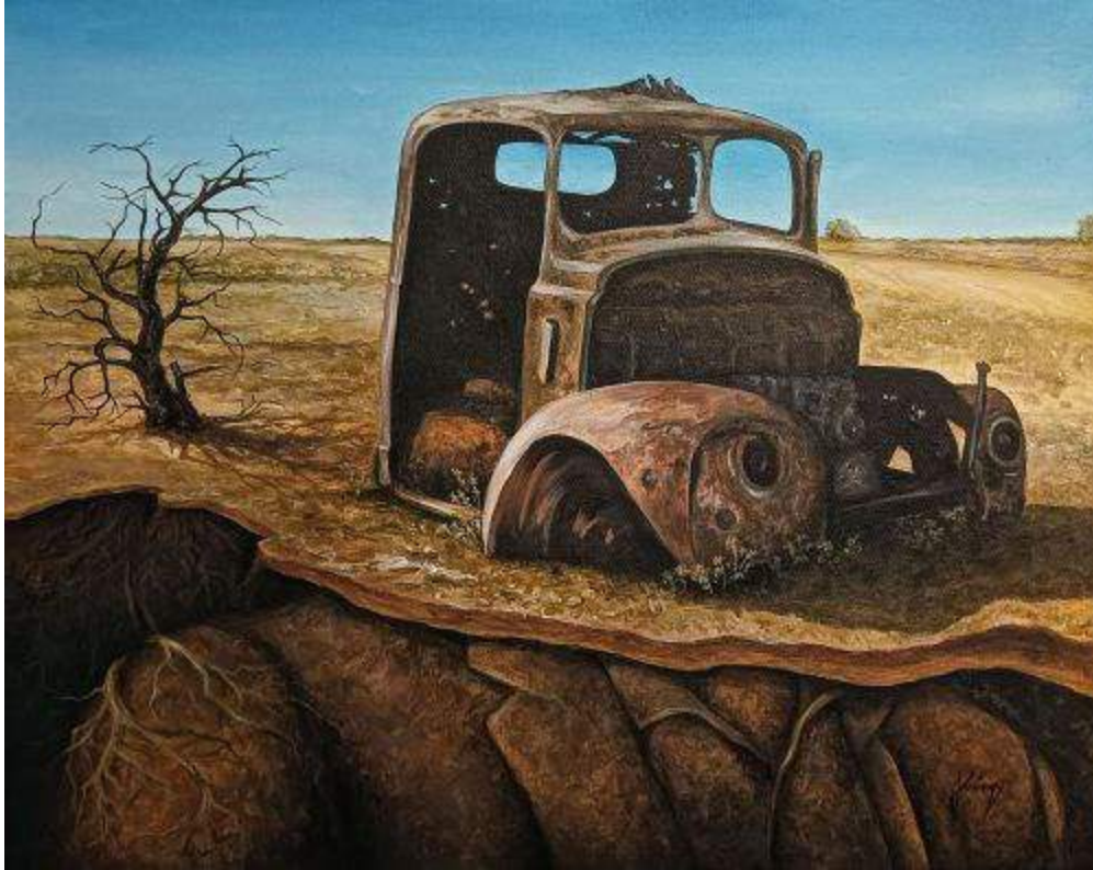
"Desert Secrets" acrylic on canvas, 50 cm x 40 cm

My father was an artist puppeteer. I spent half of my childhood behind the curtains of theatres. I enjoyed and experienced classical theatre and children's stories from a different perspective—literally from the actors and artists standpoint. That experience and stimulus also helped me to develop my own creative world.