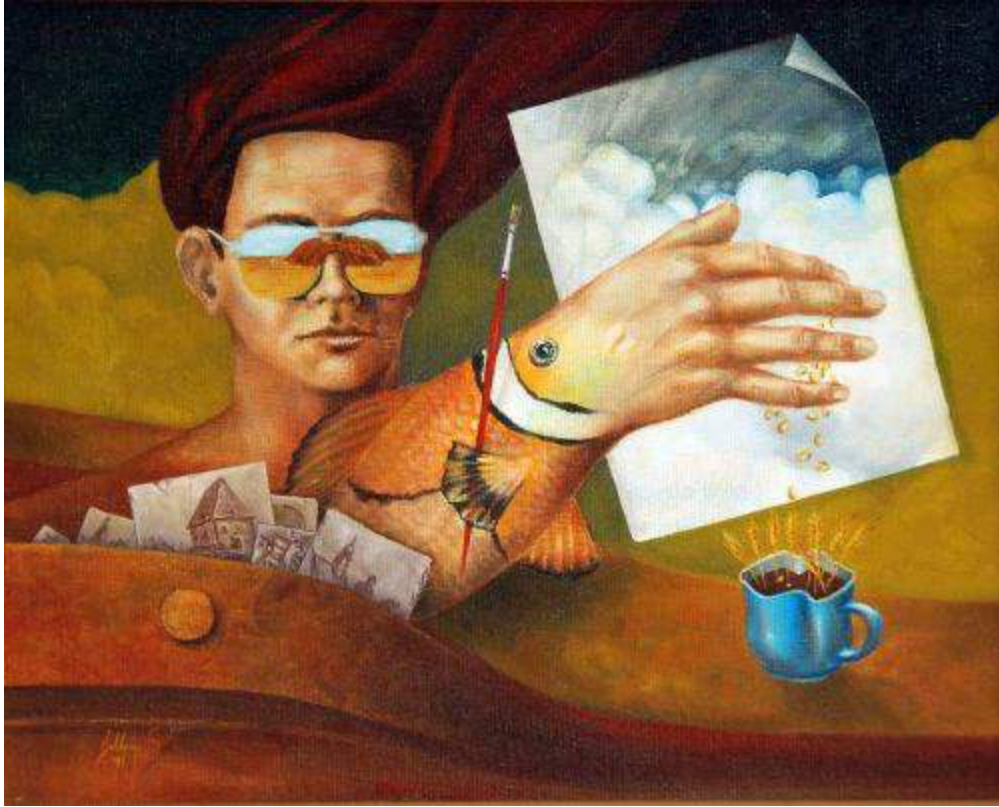
"Our Seeds" oil on canvas board, 51 cm x 41 cm