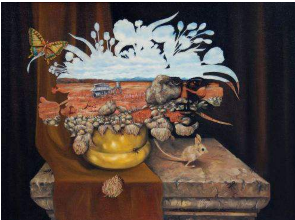
"Outback Still Life" oil on canvas, 61 cm x 46 cm