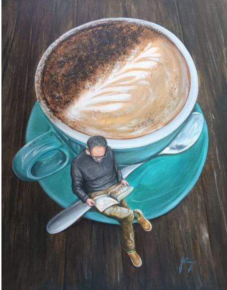
"A Quiet Moment" acrylic on canvas, 40 cm x 50 cm

After years of artistic struggle, the political situation forced me to leave the old country. I spent some time in Austria creating art and studying fine art restoration. After a successful show in Vienna, I arrived in Australia in 1987. My creative path shifted into the commercial world of graphic design and marketing. I earned an MBA in the process. During the Covid pandemic, I returned to my artistic roots with renewed focus. My work was exhibited in Australia and overseas. The year 2025 marked a significant period of artistic momentum.