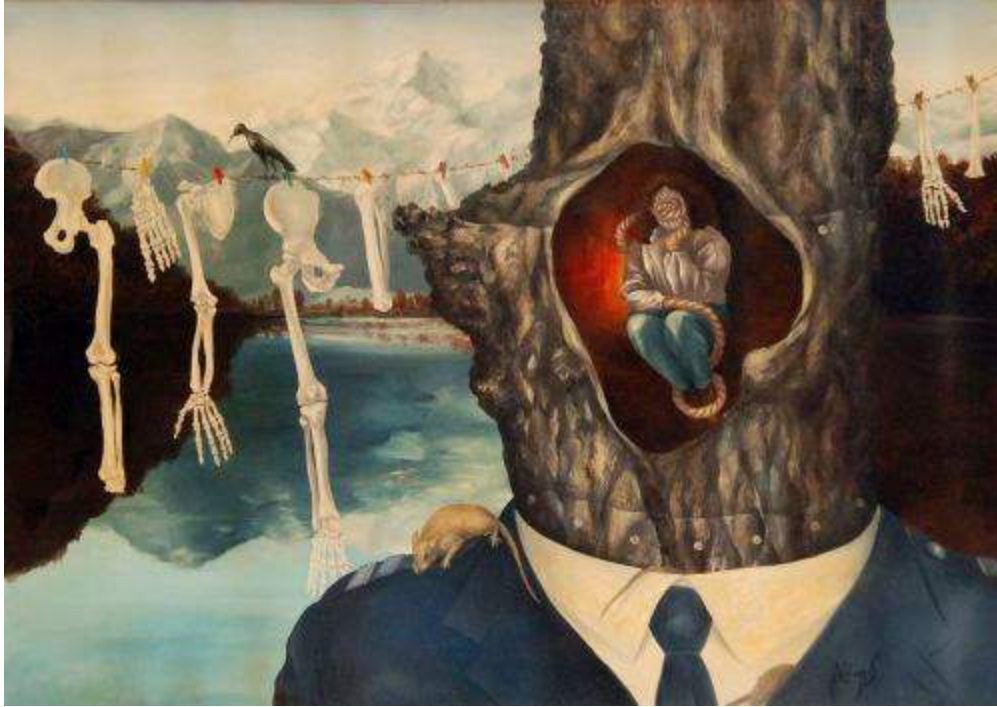
"Behind the Iron Curtain" oil on canvas, 50 cm x 70 cm