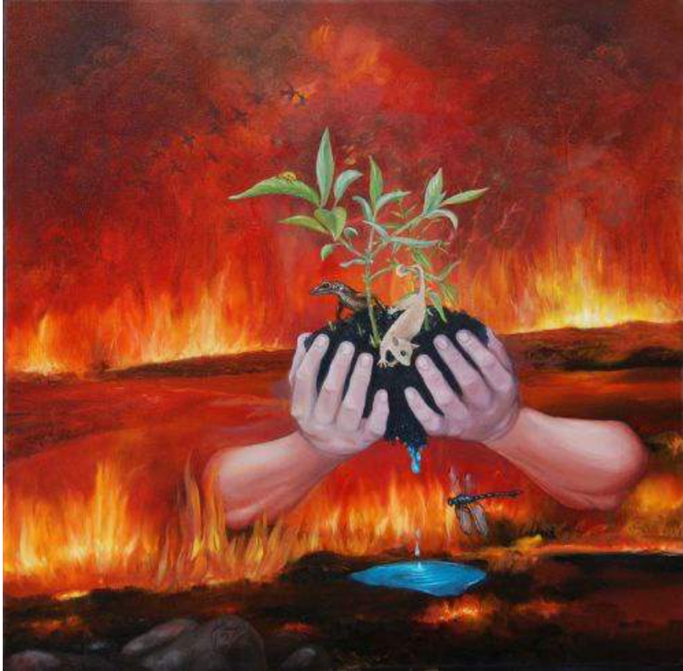
"Hope" oil on canvas, 60 cm x 60 cm

I was always drawing and painting. Not trying to copy real life, but to output my own vision through colours and forms. My parents were very supportive. At the age of 13, I had my first solo exhibition. At that time, I didn't understand the sudden media interests from newspapers and television but sensed that something significant happened that may influence the rest of my life.