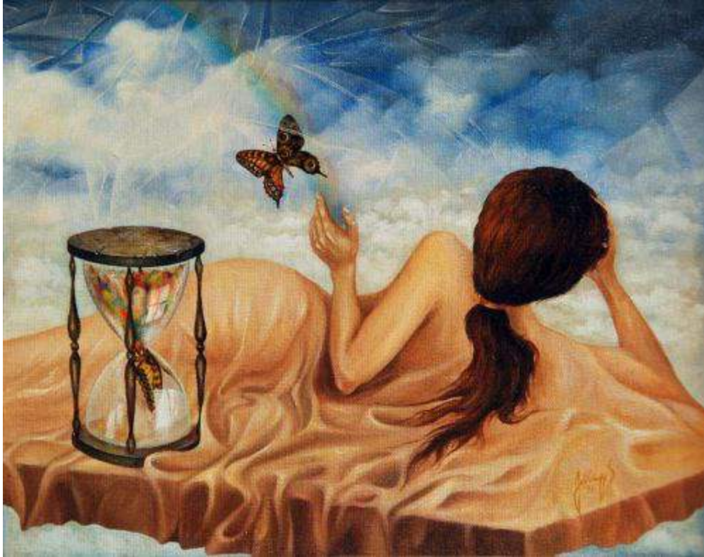
"Captive" oil on canvas board, 50 cm x 40 cm

Later, I finished four years of arts college studying visual arts. I started painting on fine porcelain and pursued further studies in ceramics. I ended up designing decorative tiles. During that time, I perfected hand painting large scale compositions of 3-4 metres on ceramic wall tiles. Some of these works still stand in hotel foyers, private and government collections, and tourist complexes at Black Sea resorts.