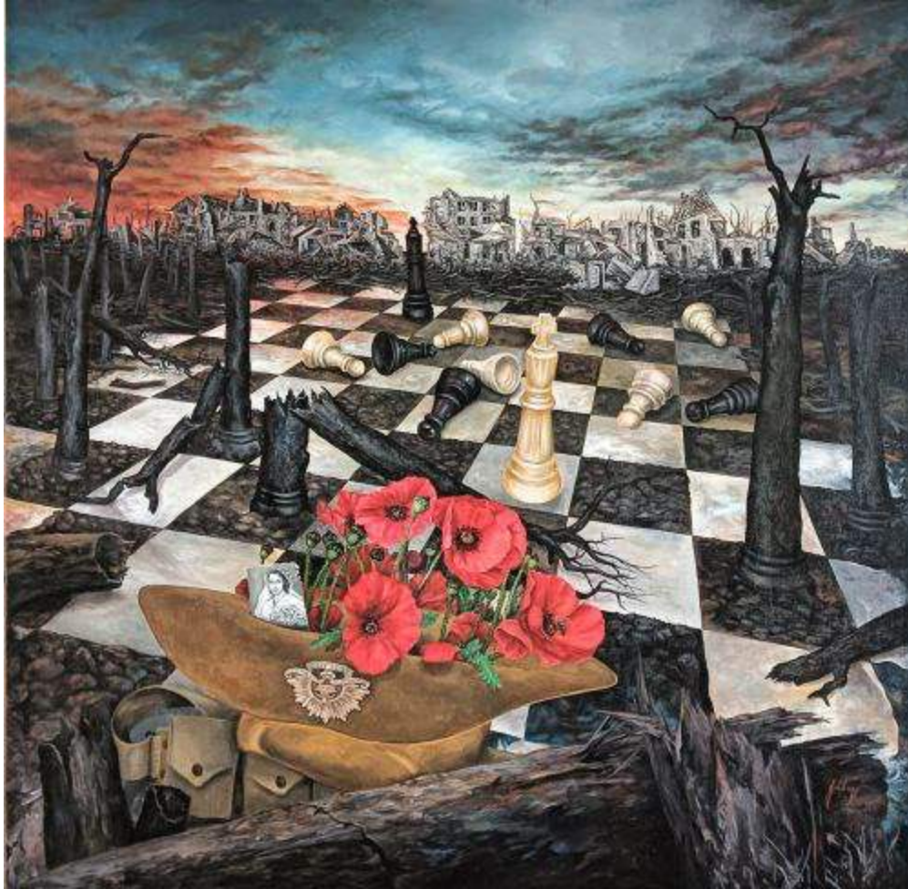
"Sacrifice" acrylic on canvas, 90 cm x 90cm

Using mainly oil and acrylic on canvas, my paintings explore human vulnerability, social fragmentation, technological control, the erosion of values, and existential disconnection. These themes are not abstract or distant; they affect the everyday lives of individuals and reflect the broader condition of our shared society.